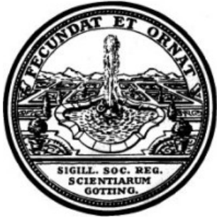
Akademie der Wissenschaften zu Göttingen